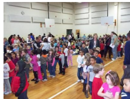
Parents and friends showed their support for winners of Awards Day recognition.

The first quarter awards assembly was enjoyed by all.