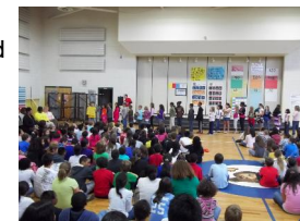
Students lined up for their recognition walk around the gym.